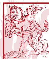
FONDAZIONE INTERNAZIONALE MENARINI

E-mail: milan@fondazione-menarini.it - website: www.fondazione-menarini.it